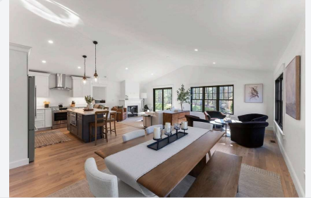
46 Sandwich Road Unit 26, Plymouth ... Comp · $1,110,379