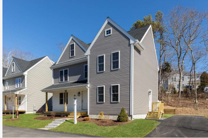
1234 State Rd Unit 5, Plymouth MA 02... Subject property · Plymouth