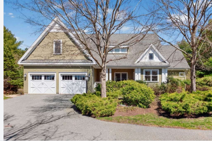
17 Shetland Unit 17, Plymouth MA 02360 Comp · $815,000